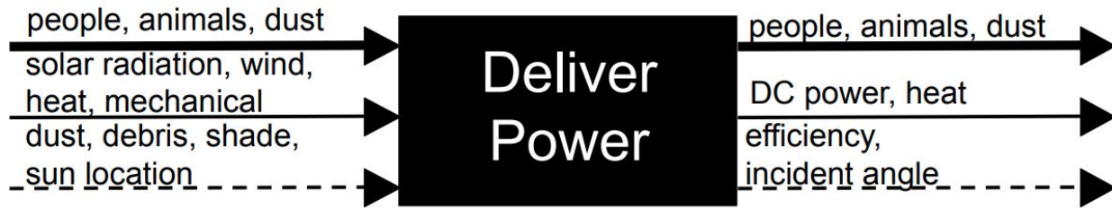
Figure 2: Black Box Model of NMSU solar panel system

The Black Box Model was used by the team to create a functional model, as well as to analyze the system for potential barriers to efficiency and sources of unsafe environments.