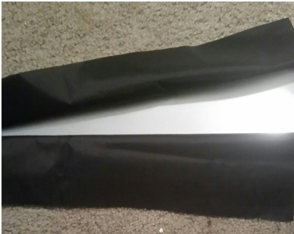
Figure 1: Preparing Hook