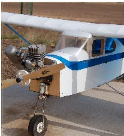
Designer / Pilot for 43rd Joint Propulsion RC Plane Competition