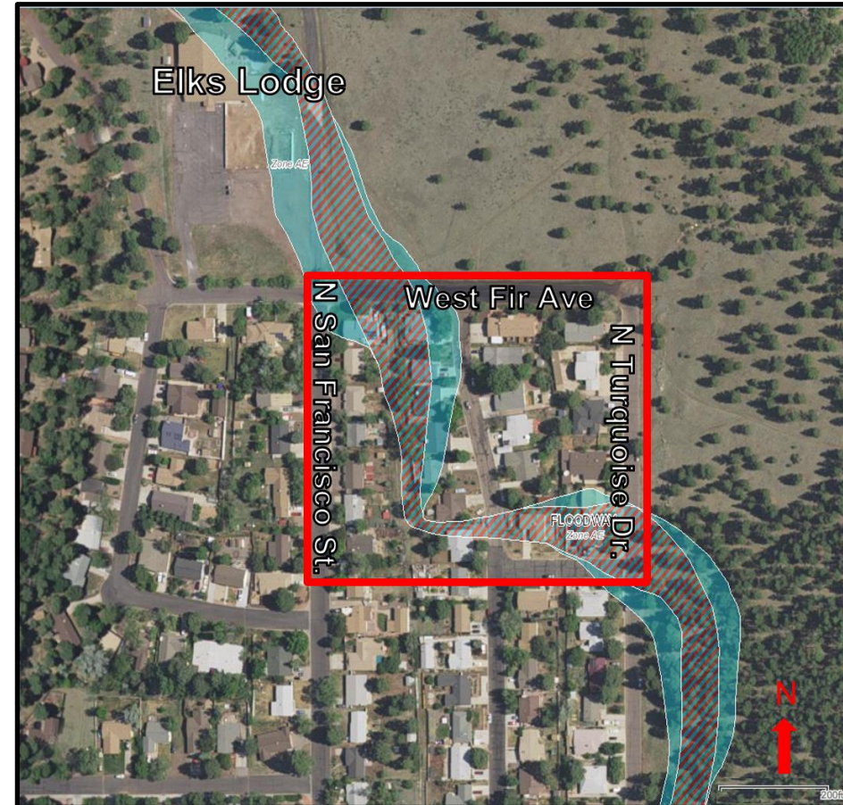
Figure 2: Aerial Map of Project Location and Area of Focus