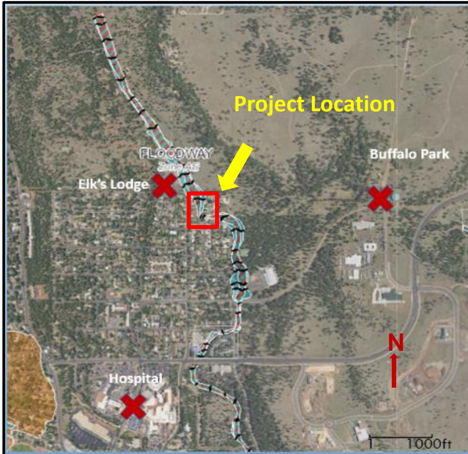
Figure 1: Aerial Map of Project Location and Floodplain