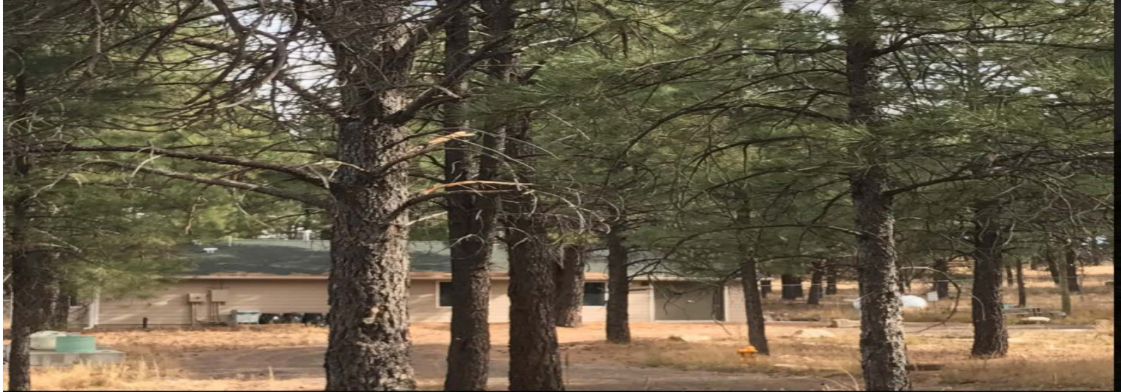
Figure 5: Trotta's farm