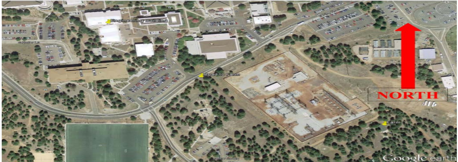
Figure 4: Trotta's farm