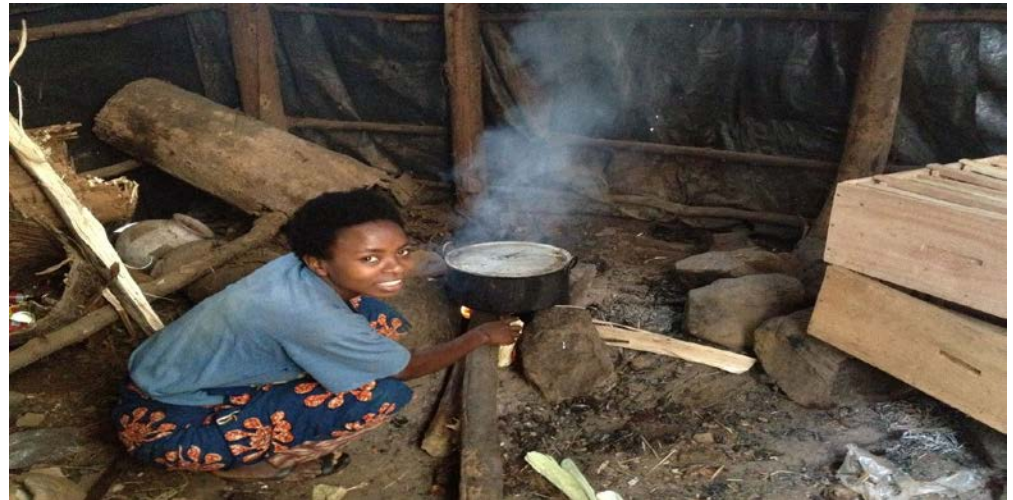
Figure 2 [3]: Smoke from cooking in stoves